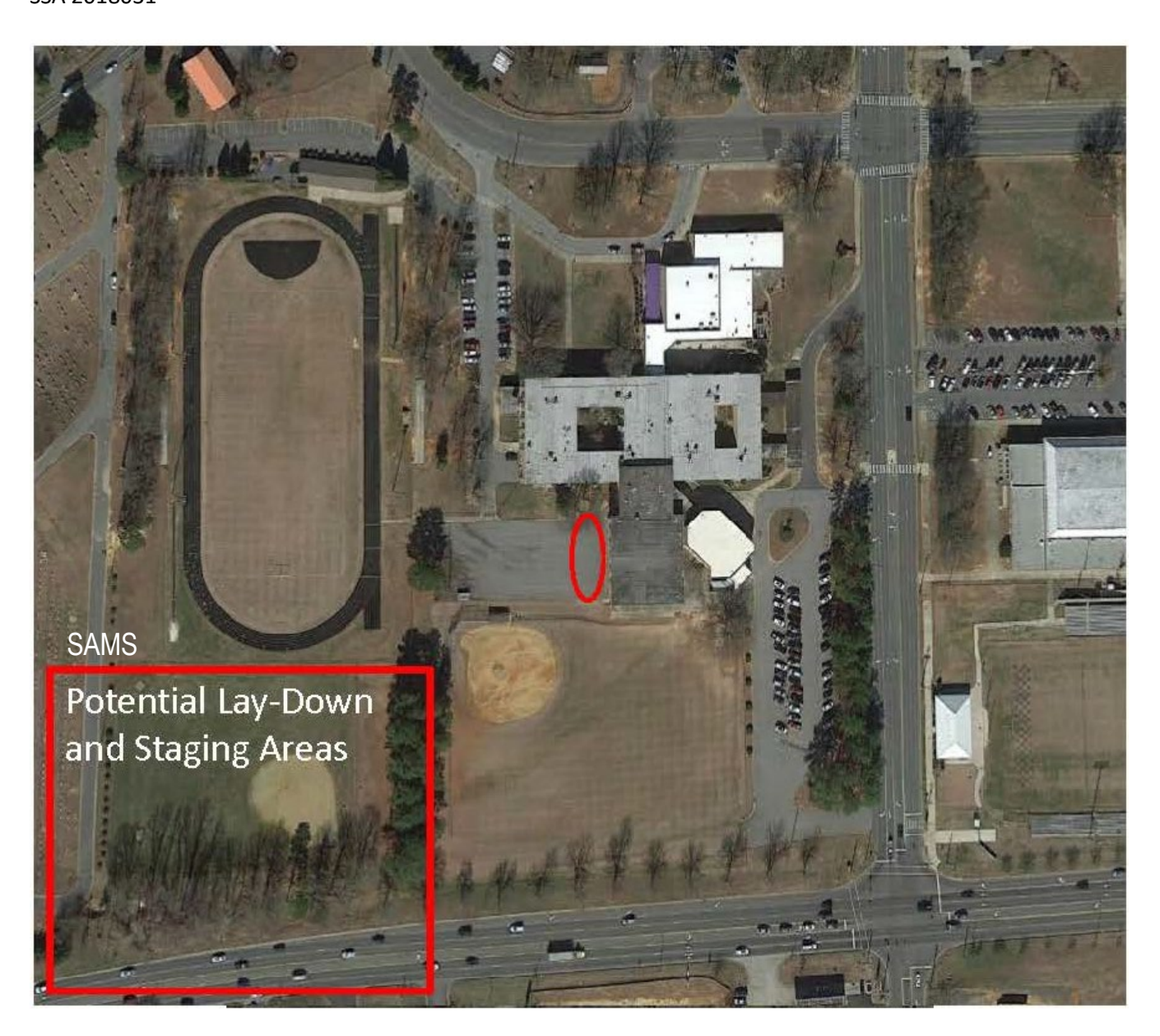
Attachment ADD – 1-01