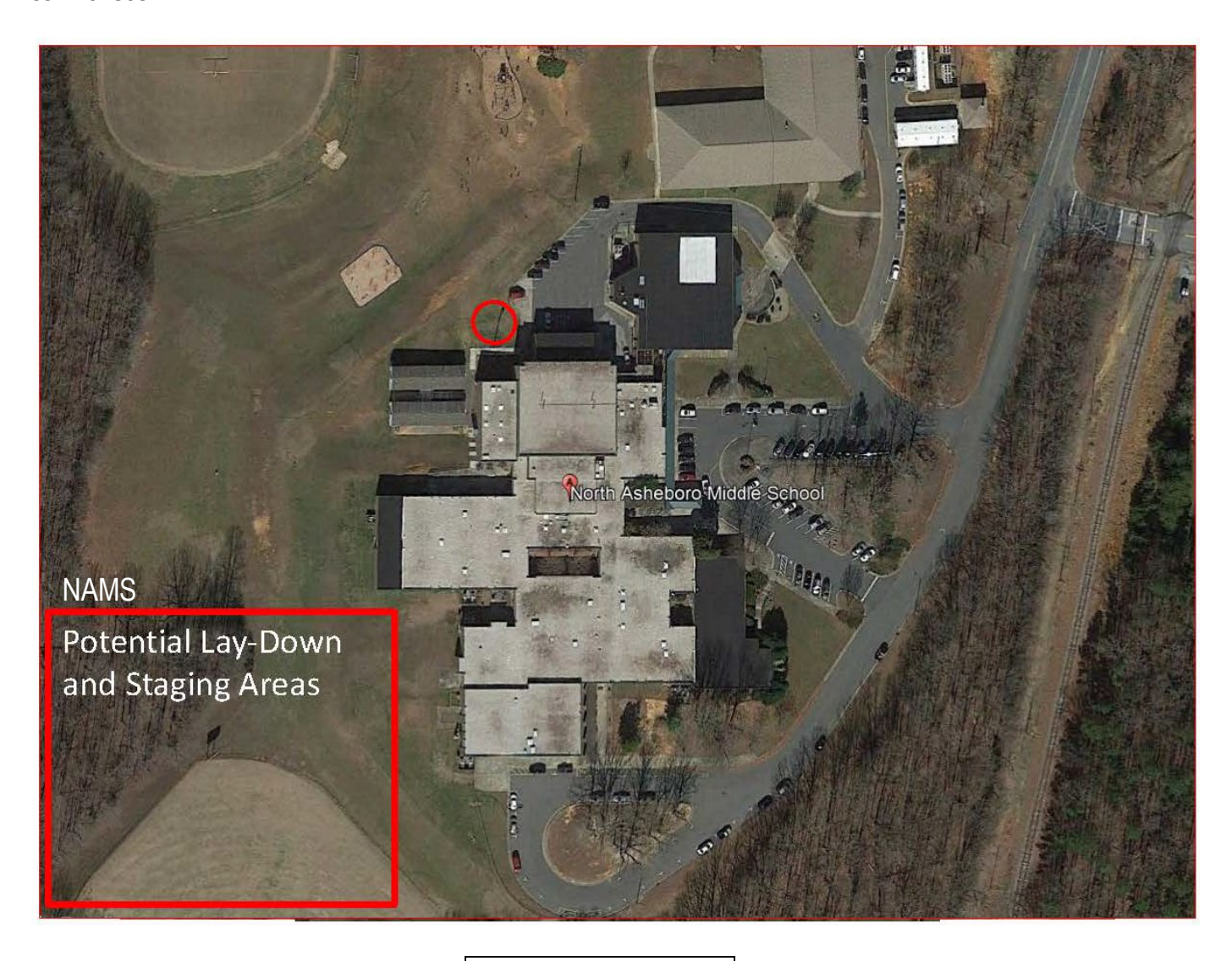
Attachment ADD – 1-01